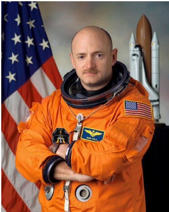
Astronaut Captain Mark Kelly Guest and Keynote Speaker

For more information contact The Manufacturers’ Association at (717) 843-3891, or office@mascpa.org .