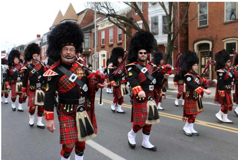
The Kiltie Band of York, PA